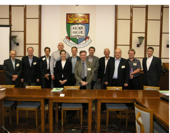
Conference speakers and organizers (below)

The conference was very well attended, demonstrating, once more, that there is a notable level of interest in serious tax research amongst practitioners and academics in Hong Kong. It was particularly pleasing to see a large contingent from Hong Kong's Inland Revenue Department in attendance.