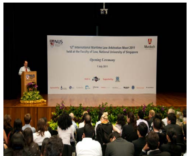
Right: The IMLAM 2011 opening ceremony at the National University of Singapore