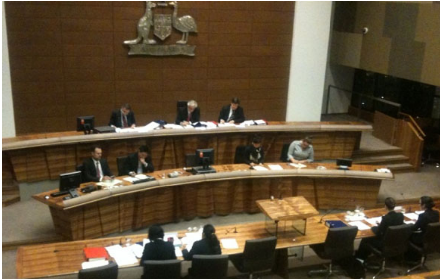
The 2010 IMLAM Grand Final, Federal Court of Australia's NSW Registry